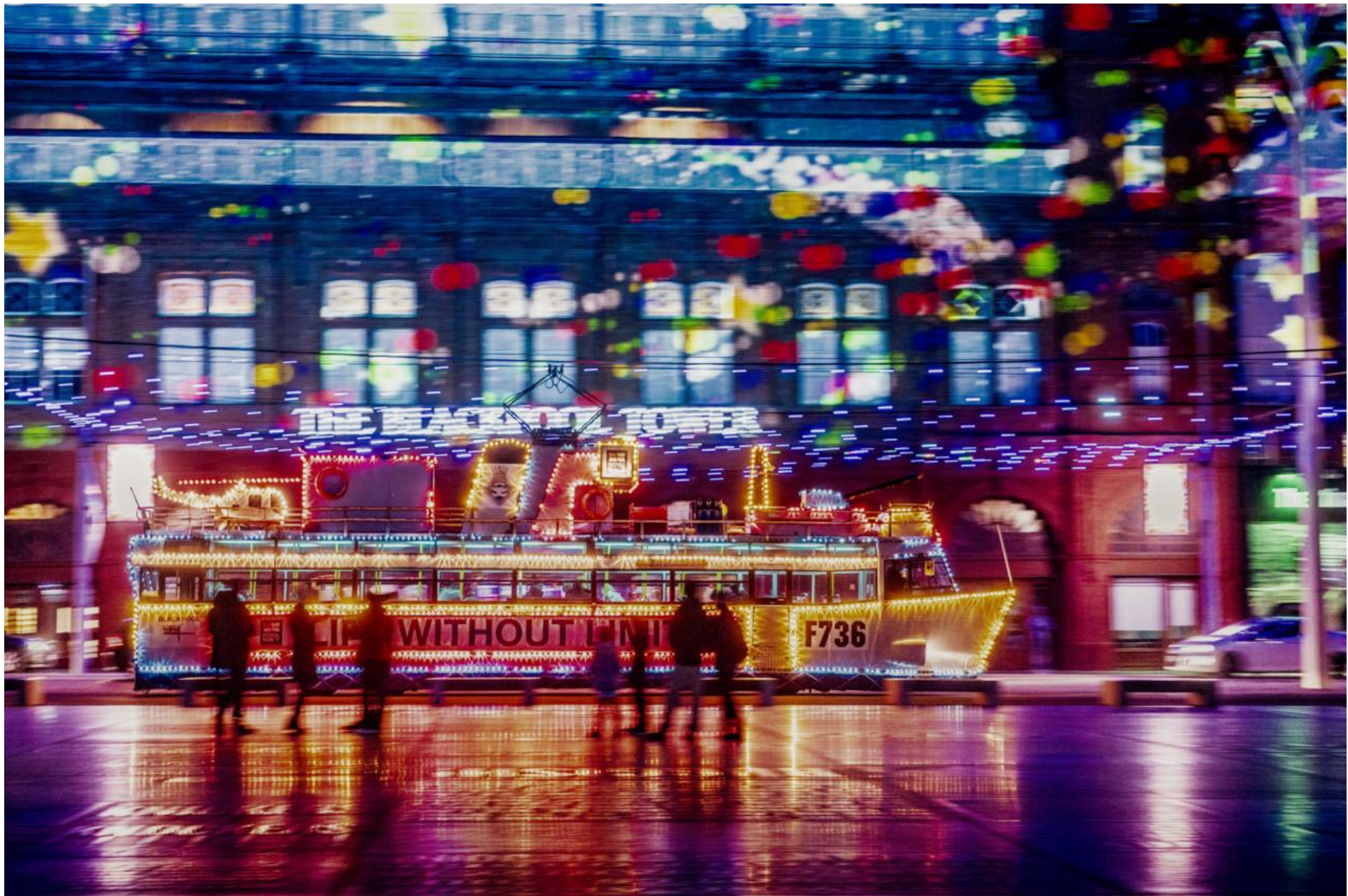
Blackpool October 2018.